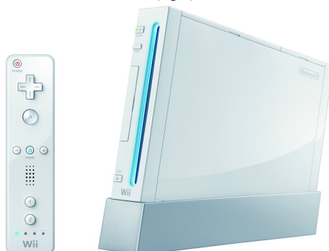
Figure 2. Nintendo Wii controller (left) and Nintendo Wii base console (right).